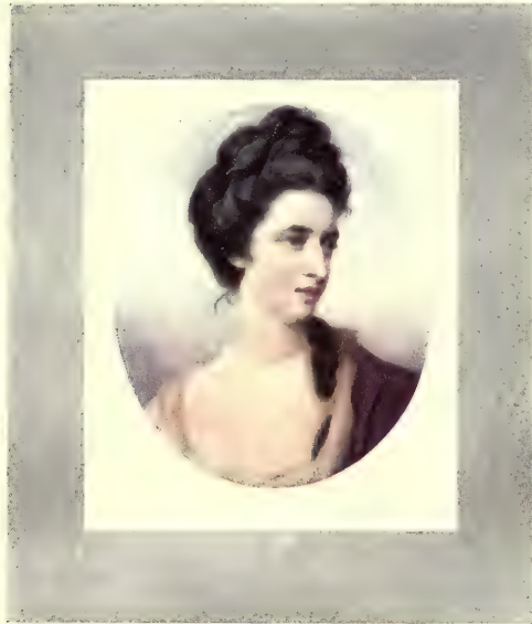
MARY, WIFE OF THE EIGHTH EARL OF THANET (OB. 1778) BY OZIAS HUMPHRY